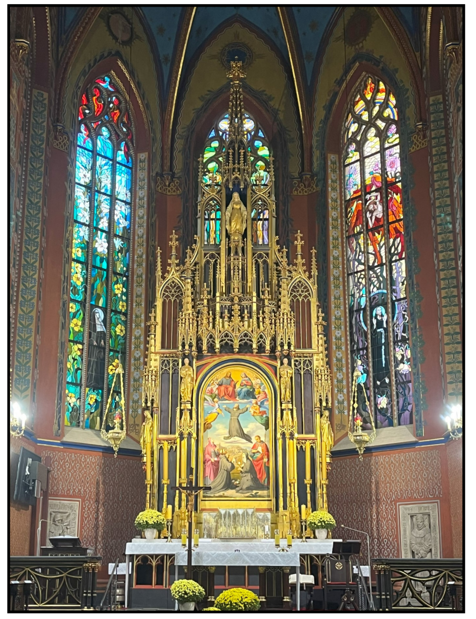
She is also depicted in a stained glass window to the left of the main altar.