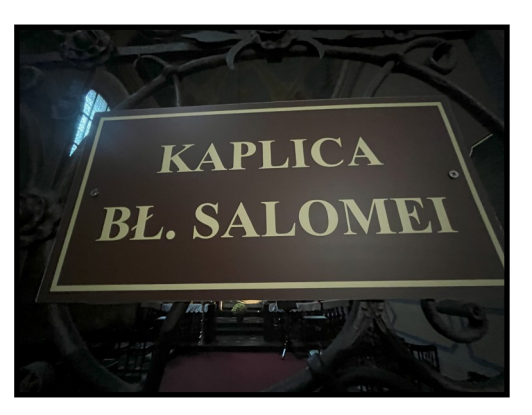
Chapel of Blessed Salomea, St. Francis of Assisi Church, Krakow, Poland